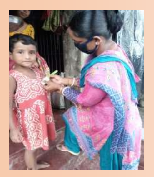
MUAC measurement taken by Home Visit

Community Facilitators are trying to arrange the weighing machine from AWC and taking the weighing of the children out side of the centres. But it is not happening at regular basis as ICDS is not allowing to do this type of activities.