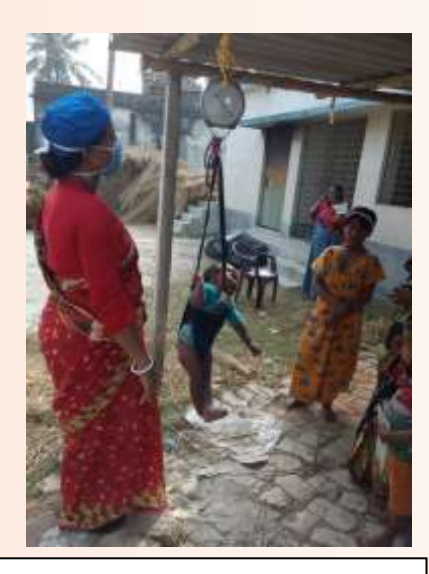
CF is mobilizing weighing machine from AWC and weighing by home visit or outside of the centre